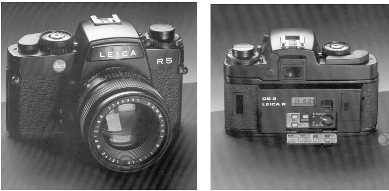
Figure 2: SLR camera Leica R5 with databack