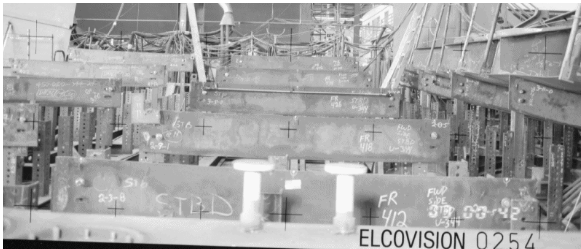
Figure 3: Part of a scanned Leica photo of the shell mocks (Project 1)

The functionality of the DCS200 is equivalent to the handling of a modern automatic SLR camera like the Leica R5. The user can select between a manual mode and several automatic or semi-automatic exposure programs. For these photogrammetric applications autofocus was switched off. As mentioned above, retro-reflective targets were used in all described applications; they gave sufficient light and allowed the