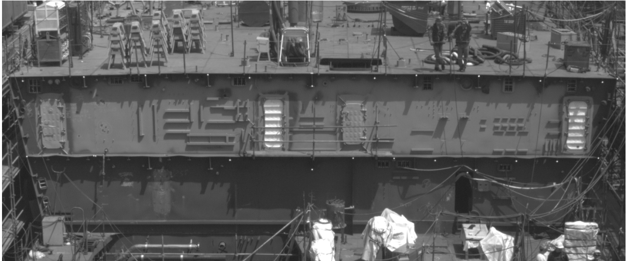
Figure 5: The unit erection on the dock with retro-reflective targets on the facade

To compensate for occlusions and to warrant a strong network geometry for the simultaneous calibration of both cameras, some additional images with panned or rotated camera axis were taken in Project 1 and 2. These camera configurations for both projects are described in Maas and Kersten (1994a) . Moreover, restricted room conditions did not allow to cover the whole object in each image.