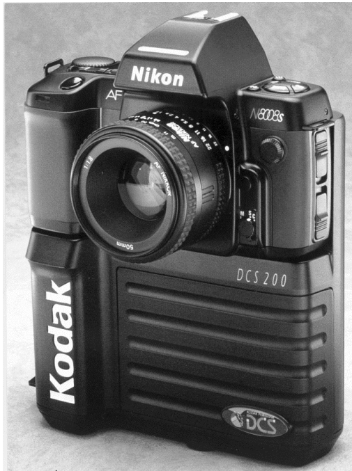
Figure 1: Kodak DCS200mi still video camera